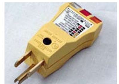
Any electrical outlet can be tested using a ground plug adaptor.

NOTE: If any other condition exists, do not use the receptacle or the Ground Plug Adapter until tested and approved by a qualified electrician. Examples of wiring defects are not limited to the conditions described below.