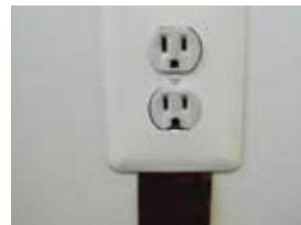
Step 7. Finish installation by re-attaching AC outlet cover with screw removed in Step 1.