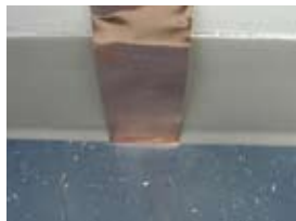
Step 6. Cover copper strip on floor with conductive adhesive and new StaticWorx ESD Flooring. For a cleaner installation, copper can be covered by wall base.