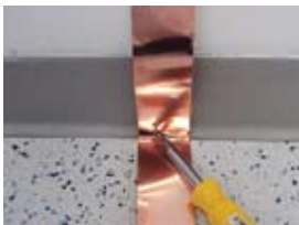
Step 5. Allow 24" copper strip to run down wall to sub floor. Fold copper at 90 degree angle at point where the wall meets the floor. Lay remainder of copper strip flat on subfloor. At least 2 inches of copper should contact the floor.