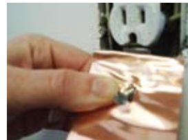
Step 3. Punch small hole in 24" copper grounding strip provided with ESD flooring. The hole should be smaller than the head of the screw removed in Step 2.