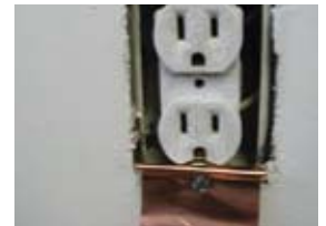
Step 4. Secure copper strip to the AC electrical outlet with the same screw removed in step 2.