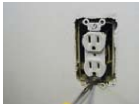
Step 2. Locate and remove grounding screw inside AC electrical outlet.